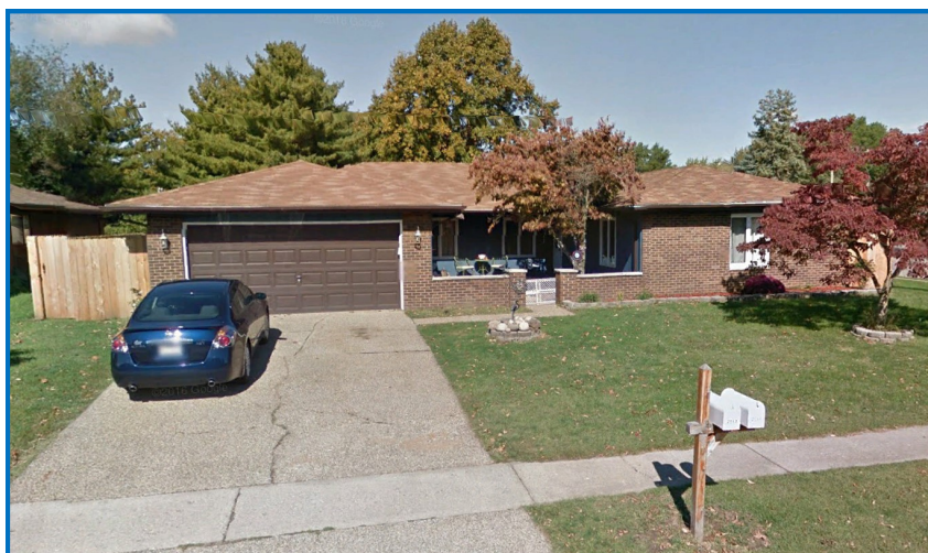
2511-2513 Gaylord Ave.