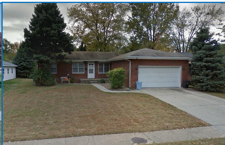
2500-2502 Milford Dr.